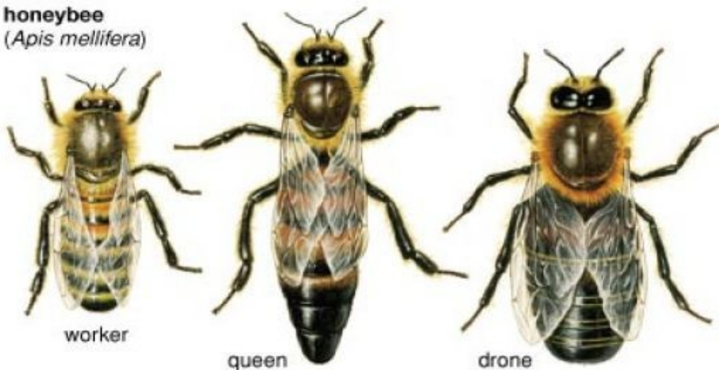
honeybee ( Apis mellifera )

No. There are different bees for different jobs. Every colony has one queen, which is the largest bee. The workers are female bees and are the smallest in size but the largest in number. There are also male drones and the brood is made up of eggs, larvae, and pupae.