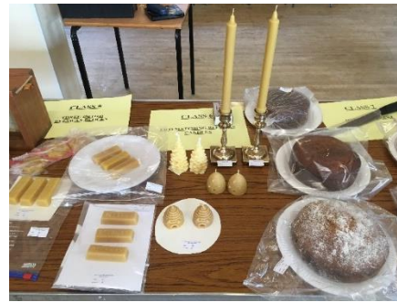
A good number of entries in the wax block and candles classes